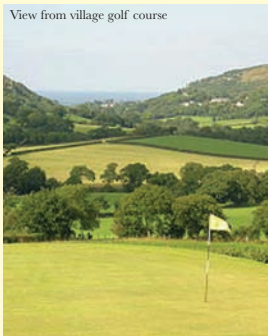
View from village golf course

Located in the beautiful North Wales countryside where there is so much to do and see: